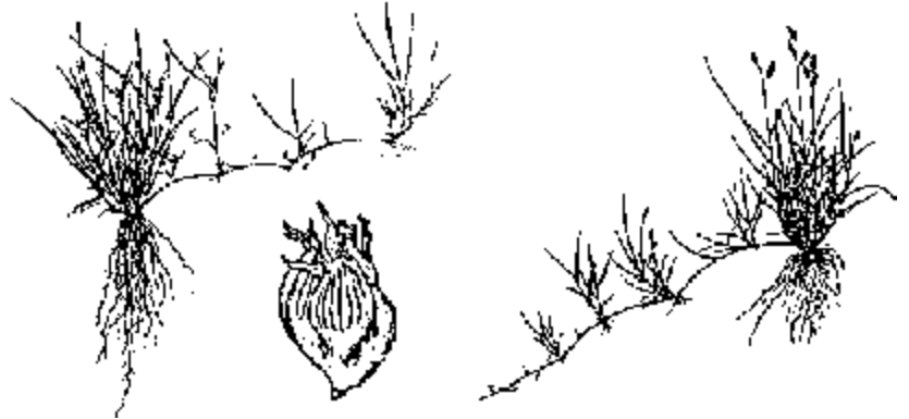
Female Plant (left), male plant (right) bur or seed (insert)

As buffalograss and curly mesquite are both low growing, stoloniferous grasses with curly leaves, some